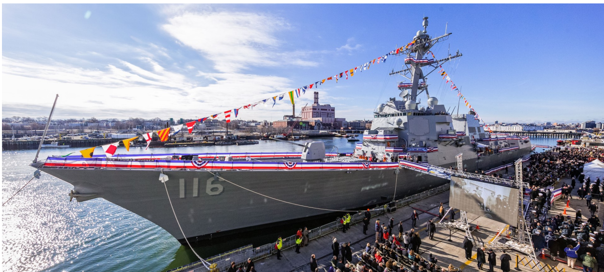
The commissioning ceremony of USS THOMAS HUDNER (DDG 116) with over 6,000 guests in attendance in December 2018. This is the last commissioning ceremony that the Massachusetts Bay Council supported.