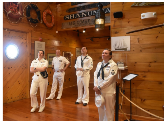
The Commanding Officer and Crew Members from Pre-Commissioning Unit NANTUCKET visit the Shipwreck and Lifesaving Museum to learn about the island's maritime heritage during a visit in June 2022.

The Commissioning Committee works to ensure that the efforts made today will have a lasting impact on the crew of the USS NANTUCKET, and build a legacy of support well into the future. The Commissioning Committee will make a significant contribution to the USS NANTUCKET's Morale, Welfare, and Recreation (MWR) Fund, and to the USS NANTUCKET's Family Readiness Group (FRG) on behalf of our donors. These funds provide support for activities for the crew and their family members throughout the year in port and at sea. The Commissioning Committee will also endow a scholarship through the Anchor Scholarship Foundation to support the crew and their families' higher education goals now and in the future. We are referring to these donations collectively as the USS NANTUCKET Crew Fund.