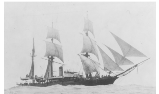
USS NANTUCKET (PG-23), 1873-1940 Formerly USS RANGER and USS ROCKPORT, then loaned to the State of Massachusetts for use at Massachusetts Nautical School, 1933.

The second ship named for Nantucket to serve in the Navy during the Great War was the iron-hulled, screw steamer with full-rig auxiliary sail built by Harlan and Hollingsworth between 1873 and 1876 in Wilmington, Delaware and initially served as the fourth USS RANGER. Serving as RANGER, the ship served in the Atlantic Squadron and on the Asiatic Station before conversion to a survey vessel in 1880. Over the next two decades it was placed in and out of commission serving along the Pacific coast and in the Asiatic Station before transferring to Boston in 1909 when she was decommissioned and loaned to the Commonwealth of Massachusetts as a school ship. RANGER was renamed ROCKPORT (October 30, 1917) and eventually NANTUCKET (February 20, 1918). While serving as NANTUCKET, the ship operated as a gunboat in the First Naval District and a training ship for Navy midshipmen. Designated PG-23 in 1920 and then IX-18 in 1921, the Ship was returned to the Commonwealth of Massachusetts as a school ship. On November 11, 1940, the Ship was transferred to the Maritime Administration for final disposition as a school ship for the Merchant Marine Academy at Kings Point, New York and was stricken from the Navy list at the end of the month.