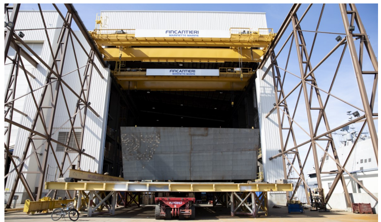
Construction of ship sections underway at Fincantieri Marinette Marine in Marinette, Wisconsin.