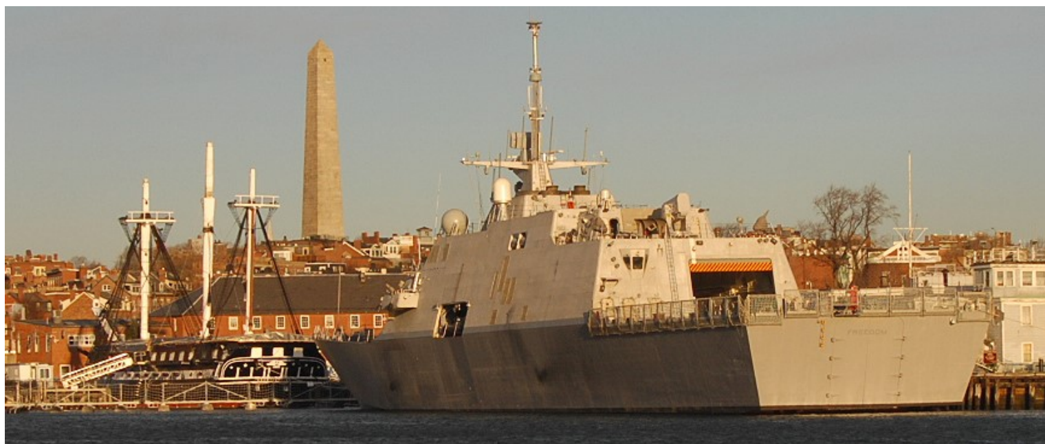
The littoral combat ship USS FREEDOM (LCS 1), the Navy's newest commissioned ship, prepares to leave its mooring next to USS CONSTITUTION in Boston following a three day port visit in December 2008.